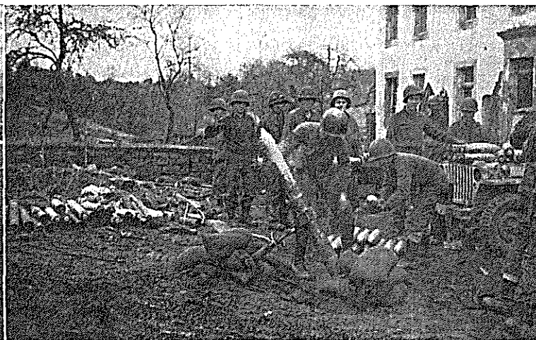
A 4.2 mortar is throwing smoke shells to cover the crossing of 5th Division troops over the Sauer River at Ballensdorf, Germany. Company B, 5th Inf. Div., near Ballensdorf, Germany.

trained that they could relieve the officers of part of their big training job.