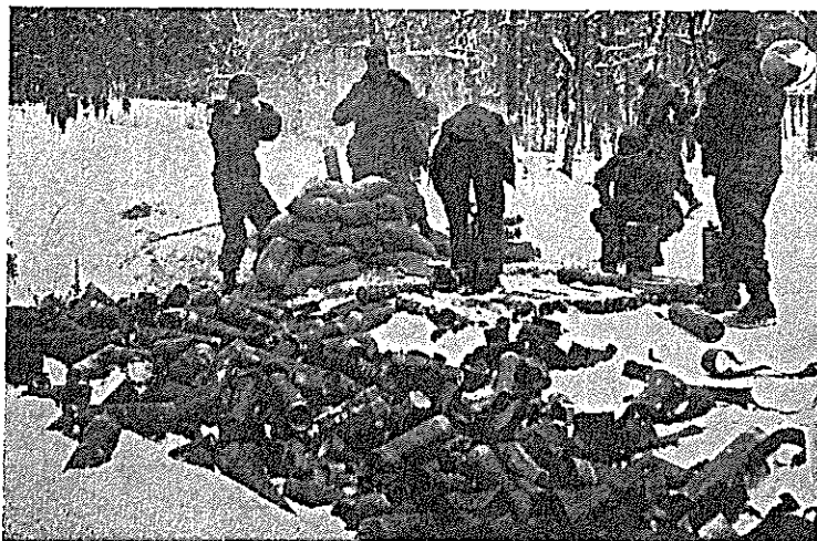
Covered by fire from this 4.2 chemical mortar crew (firing white phosphorus shells) elements of an Infantry Regiment move into a new position.

From the start, the 92nd Battalion faced a serious personnel problem. The initial group of about 400 enlisted men came from another chemical mortar battalion in England whose authorized strength had been reduced from about one thousand to less than 600 enlisted men. Considerably over one-half of this group was in the two lowest AGCT classes, four and five. Consequently, capable noncommissioned officer material for the battalion was